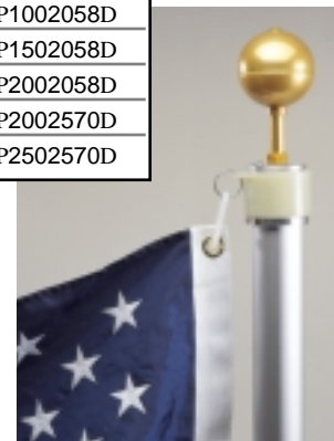
NeverFurl™ ROTATING SYSTEM

PATIO flagpoles can also be fitted with the NeverFurl™ rotating system. This alternative, ideal for use with a permanently flown flag, utilizes the popular NeverFurl device in lieu of the traditional truck/halyard/cleat configuration. Included with the dual NeverFurl assemblies are a cast aluminum fitted end plug and a gold anodized, spun aluminum ball.