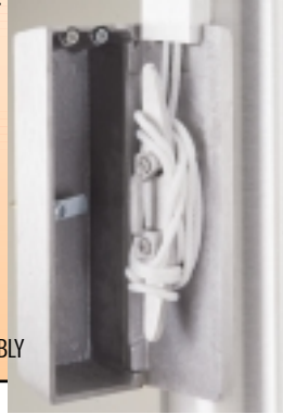
CLEAT COVER ASSEMBLY

Cleat covers offer protection against unauthorized tampering on external halyard flagpoles. Made of heavy, cast aluminum with stainless steel hinge pins, cleat covers are available in sizes that compliment the flagpole base diameter and exposed height. Cleat covers are available with a factory installed six tumbler lock or with heavy padlock tabs for use with padlocks (not included). For additional protection, cleat covers may be combined with a 5' long polished extruded aluminum halyard channel. The halyard channel is secured by a heavy upper cast bracket and by the cleat cover lid when closed. Cleat covers and halyard channels are provided in a finish to compliment the flagpole.