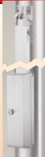
CLEAT COVER SHOWN WITH OPTIONAL HALYARD CHANNEL